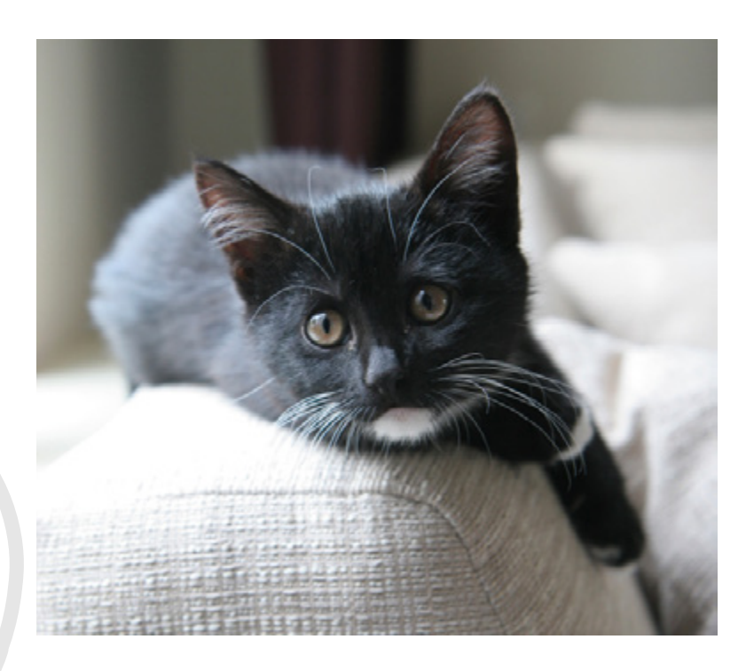
/continued from page 1

To make arrangements to have your donation picked up or to drop it off, please email info@felinefriends.ca.