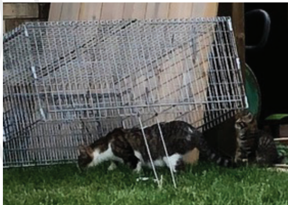
Example of a drop trap