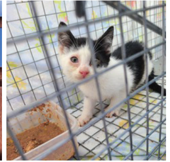
Maggie (left) and one of her kittens (right)