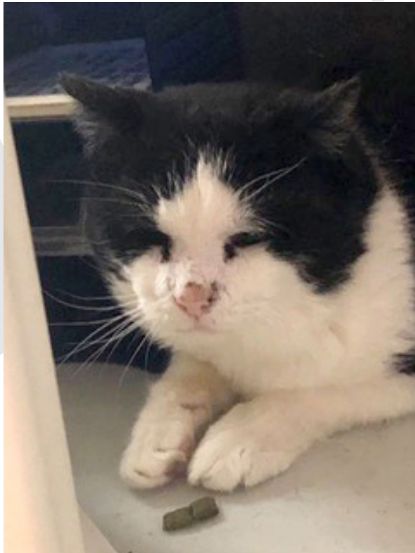
Zeke was shy and in pain when he came into FFN's care