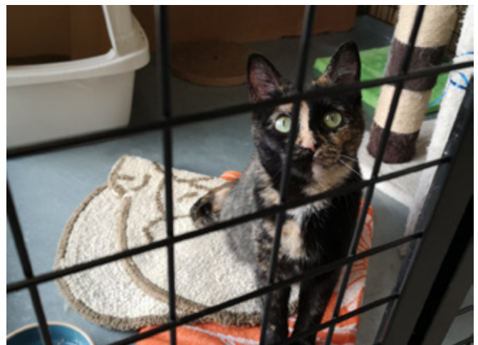
(above) former FFN foster kittens Potato & Tucker (in hammock) just hangin' out with a pal in the cat room at the Alley Cat Café; (below) beautiful Josie in the cat condo at Feed-All Pet Centre. Potato, Tucker, and Josie were all successfully adopted.