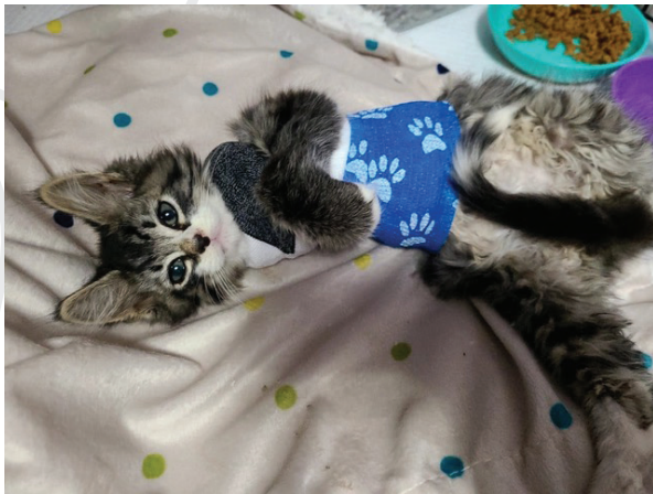
Miller bandaged and healing after surgery

One case was a little kitten named Miller, who was found crying in a field. His leg was severely injured and his mother had abandoned him. After a midnight visit to the emergency clinic, he was sent home with pain medication and an appointment was set up with one of our partnering veterinarians.