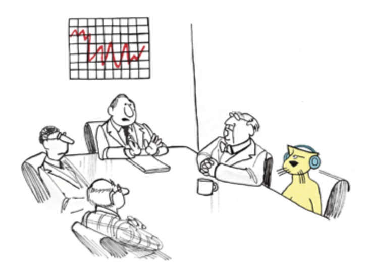
"I just wonder if there aren't some team members who could be a bit more focused in meetings."